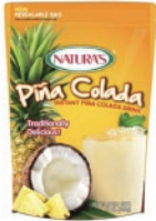
Naturas Pina Colada 12/12oz CASE CODE: BEV091