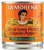
La Morena Jalapeno Sliced 1 12/13oz - JAL024 2 12/28oz - JAL025 3 24/7oz - JAL026