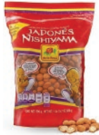
De la Rosa Japonés 900g CODE: CAN240