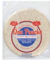
Don Pancho Flour Tortilla 13" 10/10ct CODE: TOR009