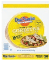
Don Pancho Flour Tortilla 6" 12/16ct CODE: TOR059