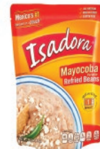
Isadora Peruano Refried Beans 8/15.2z CODE: BEN005