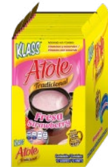
Klass Atole Guayaba 12/1.52oz CODE: BEV205-2