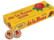
De la Rosa Mazapan 30pcs CODE: CAN43