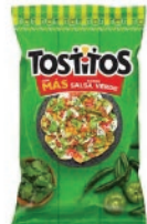
Tostitos 1 Green 175g - SNK071 2 Green 28/74g - SNK072 3 Flaming 175g - SNK073