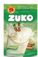
Zuko Horchata 12/400g CODE: BEV129