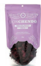
Don Chendo Hibiscus - Jamaica 10/100g CASE CODE: BEV033-3