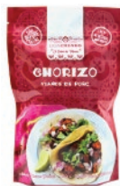
Don Chendo Chorizo Loose 450g CODE: DON098

Traditional Mexican sausage mixed with a blend of peppers and spices.