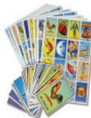
Loteria 20 Tablas CODE: HSW024