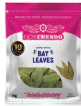
Don Chendo Bay Leaves 10/15g CASE CODE: DON003