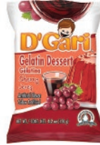
D'Gari gelatina Jerez 24/170g CODE: GRO023