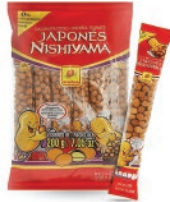
De la Rosa Japonés 12/6pc/170g CODE: SNK308