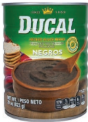
Ducal Black Refried bean