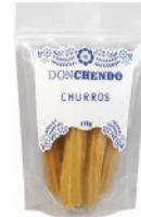
Don Chendo Churros 10/175g CODE: DON127