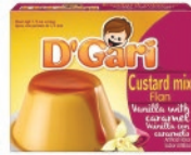
D'Gari Flan Caramelo 24/170g CODE: CAN49