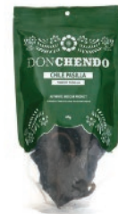
Don Chendo Chile Pasilla 15/ 60g CASE CODE: CHL010-5