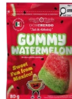
Don Chendo Gummy Watermelon 15/80g CODE: CAN327