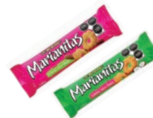
Marianitas 20/6.5oz 1 Pecan - BKR055 2 Coconut - BKR049