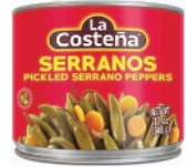
La Costeña Serrano 12/12oz CODE: JAL019