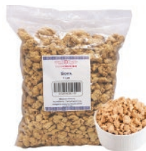
Soya Natural 1 lb CODE: GRO091