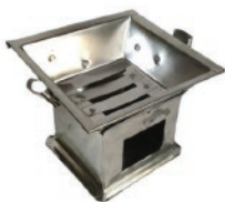
Bracero Mexican Med CODE: HSW089