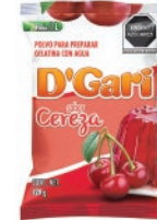
D'Gari gelatina Cereza 24/170g CODE: GRO017