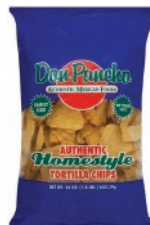
Don Pancho HomeStyle Chip 7/21oz CODE: CHI002