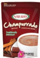
Naturas Champurrado 12/12oz CASE CODE: BEV087