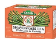
Tadin Te de Cola de Caballo 6/24ct CODE: GRO073