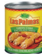
Las Palmas Green sauce

1 Yellow 24/7.75oz - SAL007 2 Yellow 12/27oz - SAL045 3 Red 24/7.75oz - SAL006 4 Green 24/7.75oz - SAL005