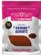
Don Chendo Ground Achioté 15/80g CASE CODE: SEA107-5