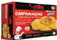
Panna Colombian Beef Empanadas 12/4pcs CODE: SOM054