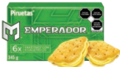
Gamesa Emperador Limon 6pack CODE: BKR016