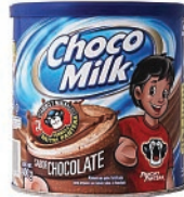
Choco Milk Pancho Pantera 12/400g CODE: BEV011