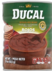
Ducal Red Refried bean