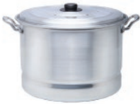
Olla 1 Large - HSW070 2 Medium - HSW069