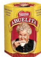
Chocolate Abuelita 12/19oz CODE: BEV013