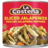
La Costeña Jalapeno Sliced 1 12/12oz - JAL012 2 12/28oz - JAL022 3 24/7oz - JAL013