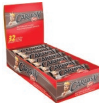
Chocolate Carlos V 32pcs CODE: CAN34