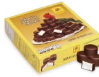
De la Rosa Bombon Chocolate 50pc CODE: CAN39