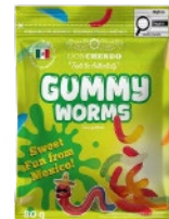
Don Chendo Gummy Worms 15/80g CODE: CAN330