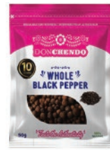
Don Chendo Whole Black Pepper 10/50g CASE CODE: DON010-1