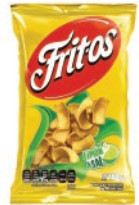
Fritos Limón y Sal 180g CODE: SNK032