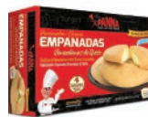
Panna Venezuelan Empanada 1 Beef 4pcs - ARK010 2 Cheese 4pcs - ARK011 3 Chicken 4pcs - ARK012