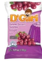
D'Gari gelatina Uva 24/170g CODE: GRO030