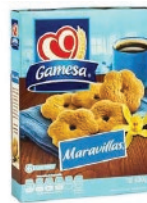
Gamesa Maravillas 8/490g CODE: BKR017