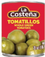
La Costeña Whole Tomatillo 12/28oz CODE: TOM007