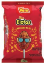
Vero Elotes 40pcs CODE: CAN119