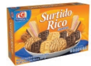
Gamesa Surtido Rico 437g CODE: BKR018