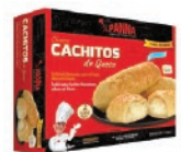
Panna Cachito 12/4pcs CODE: ARK009