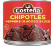
La Costeña Chipotle Peppers 1 12/12oz CASE - CHP006 2 24/7oz CASE - CHP007