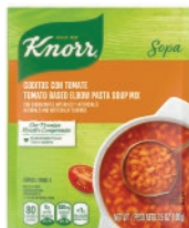
Knorr Soup Pasta Elbows 12/3.5 oz CODE: PAS023