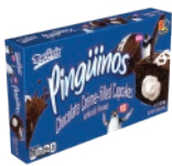
Pinguinos 8pcs CODE: BKR033