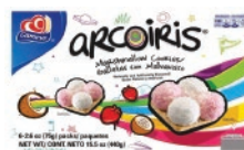
Gamesa Arcoiris 15.5 oz CODE: BKR051