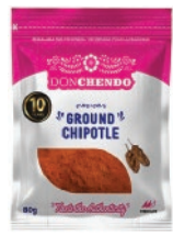
Don Chendo Ground Chipotle 10/80g CASE CODE: SEA049-2