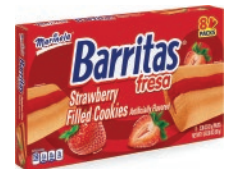
Barritas Strawberry 8 pack CODE: BKR002-2