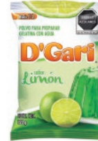
D'Gari gelatina Lime 24/170g CODE: GRO024