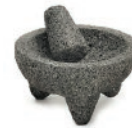
Molcajete 1 Large - HSW090 2 Medium - HSW189