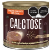
Cal C Tose 12/400g CODE: BEV009