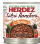
Herdez Salsa Ranchera