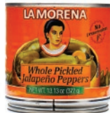
La Morena Jalapeno Whole 1 12/13oz - JAL028 2 12/28oz - JAL030 3 24/7oz - JAL029