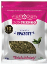
Don Chendo Epazote 10/25g CASE CODE: SEA026-3