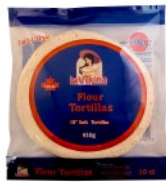
La Vikina Flour Tortilla 10" 10/10ct CODE: TOR026