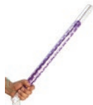
Pinata Stick CODE: HSW083