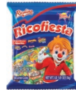
Ricolino RicoFiesta Pinatero 3.3lb CODE: CAN146