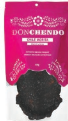
Don Chendo Chile Morita 15/ 60g CASE CODE: CHL008-6