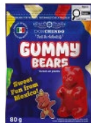
Don Chendo Gummy Bears 15/80g CODE: CAN331