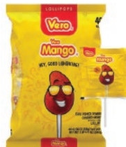
Vero Mango 40pcs CODE: CAN120