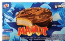
Mamut 8pcs CODE: BK021-2