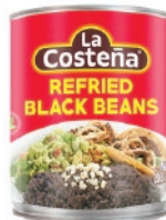
La Costeña Refried Black 12/20oz CODE: BEN014