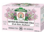
Tadin Te de Siete Azahares 6/24ct CODE: GRO077