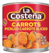
La Costeña Carrots 12/14.1oz CODE: JAL009