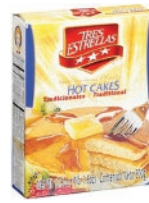
Tres Estrellas Hot Cakes Flour 12/17.6oz CODE: FLR002