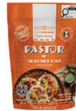
Don Chendo Pastor 450g CODE: DON088

Slow-cooked pork in pineapple juice, vinegar, and spices.