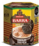
Chocolate Ibarra 12/19z CODE: BEV016