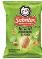
Sabritas Peanuts Sal y Limón 12/198g CODE: SNK060