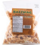
Mang Ramon Chicharron 24/85g CASE CODE: SNK053