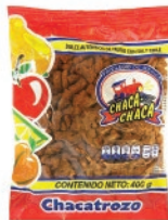
Chaca Chaca Chacatrozo 400g CODE: CAN33