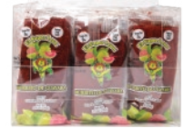
Super Leon Burrito 24pack 1 Guava - CAN23 2 Mango - CAN24 3 Tamarind - CAN25