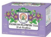
Tadin Te de Pasiflora 6/24ct CODE: GRO076