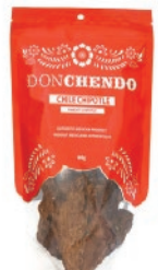
Don Chendo Chile Chipotle 15/ 60g CASE CODE: CHL006-6