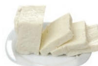
Cotija Cheese kg CODE: CHE017