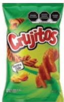
Crujitos 120g CODE: SNK025