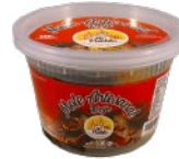
Mi pueblo Mole Rojo