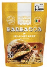
Don Chendo Barbacoa 450g CODE: DON002

Slow-cooked beef in a blend of peppers and spices known as adobo.