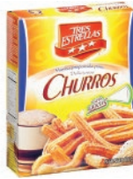
Tres Estrellas Churros Flour 12/17.6oz CODE: FLR001