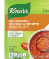
Knorr Soup Pasta Star 12/3.5oz CODE: PAS003