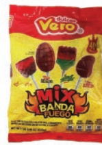
Vero Banda Mix 40pcs CODE: CAN133