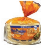
Don Pancho Corn Tortilla 6/46ct CODE: TOR054