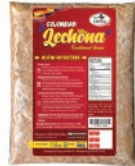
Don Chendo Lechona 450g CODE: DON155