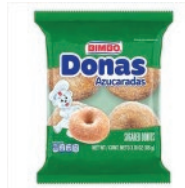
Bimbo Donas CODE: BKR011