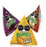
Boing Triangle 3/6/200ml CASE CODE: BEV004