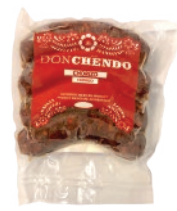
Don Chendo Chorizo Sausage 1 lb CODE: DON100