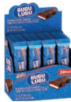
Bubulubu 24pcs CASE CODE: CAN20