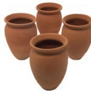
Cantarito Decorative 24pcs CODE: HSW001