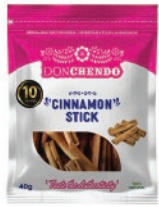
Don Chendo Cinnamon Stick 10/40g CASE CODE: SEA015-2