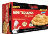
Panna Cheese Mini Tequeños 1 10pcs - ARK002 2 18pcs - SOM049