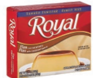
Royal Flan Caramelo 12/5.5z CODE: BKR039