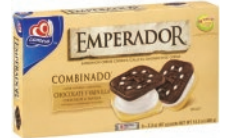
Gamesa Emperador Combinado 6pack CODE: BKR044