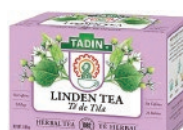
Tadin Te de Tila 6/24ct CODE: GRO078