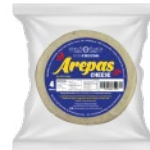
Don Chendo Cheese Arepa 4pcs CODE: DON137