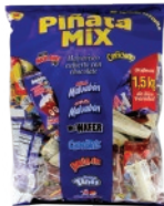
De La Rosa Pinata Mix Chocolate 1.8kg CODE: CAN224