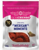
Don Chendo Mexican Moments 10/80g CASE CODE: DON050