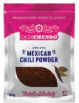
Don Chendo Mexican Chili Powder 10/80g CASE CODE: SEA069-2