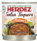
Herdez Salsa Taquera