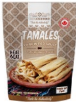
Don Chendo Tamal Pork Red Sauce CODE: DON069-2