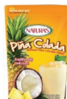
Naturas Pina Colada 12/12oz CODE: BEV091