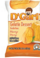
D'Gari gelatina Mango 24/170g CODE: GRO025