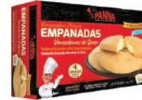
Panna Empanada Venezolana Cheese 4pcs CODE: ARK011