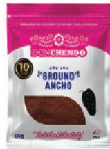
Don Chendo Ground Ancho 10/80g CASE CODE: SEA045