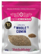
Don Chendo Whole Cumin 15/60g CASE CODE: SEA105-4