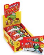
De la Rosa Chocolate Ranita Croa 12pcs CODE: CAN42