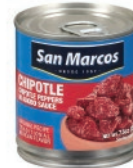
San Marcos Chipotles 24/7oz CODE: CHP012