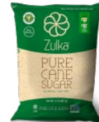
Zulka Cane Sugar 10/2lb CODE: GRO099