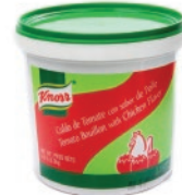
Knorr Sazonador Tomato 2kg CODE: SEA091