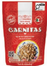
Don Chendo Carnitas 450g CODE: DON087

Tender pulled pork slow-cooked in its savory marinade and spices.