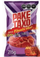
Pake Taxo 1 Flaming Hot - SNK086 2 Mezcladito - SNK087 3 Quexo - SNK238 4 Botanero - SNK239