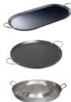
Comal 1 Oval - HSW086 2 Redondo Med - HSW005 3 Sombrero Med - HSW079