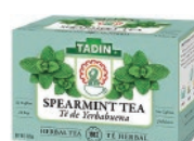
Tadin Te de Yerbabuena 6/24ct CODE: GRO079