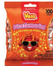
Vero Pica Tamarindo gummies 100pcs CODE: CAN128