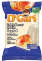
D'Gari gelatina Crystal 24/170g CODE: GRO019