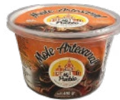
Mi pueblo Mole