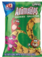
Gamesa Animalitos 12/16oz CODE: SNK207