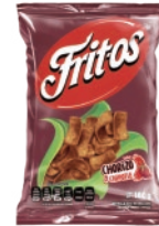
Fritos Chorizo 180g CODE: SNK031