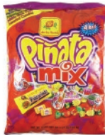
De la Rosa Pinata Mix 4lb CODE: CAN47