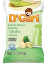
D'Gari gelatina Pistachio 24/170g CODE: GRO172