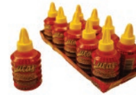
Lucas Gusano 10ct 1 Chamoy - CAN138 2 Tamarindo - CAN59