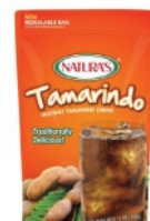
Naturas Tamarind 12/12oz CODE: BEV092