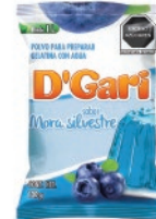
D'Gari gelatina Blueberry 24/170g CODE: GRO016