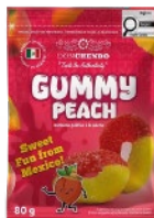
Don Chendo Gummy Peach 15/80g CODE: CAN332