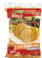
Tio Jorge Fried Plantain (Tostones) 20/1lb CODE: SOM045