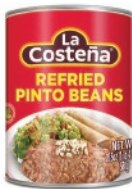
La Costeña Refried Pinto 12/20oz CODE: BEN008