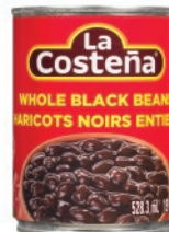
La Costeña Whole Black 12/20oz CODE: BEN007