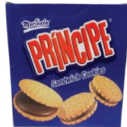
Marinela Principe 12pc CODE: BKR036