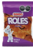
Bimbo Roles de Canela 365g CODE: BKR038