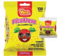
Vero Pica Fresa gummies 100pcs CODE: CAN127