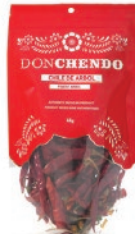
Don Chendo Chile Arbol 15/ 60g CASE CODE: CHL004-6