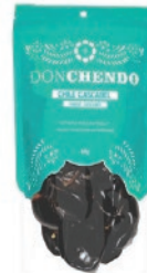
Don Chendo Chile Cascabel 10/ 60g CASE CODE: CHL014-5