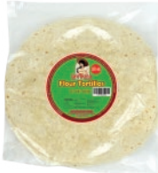
La Vikina Flour Tortilla 12" 12/10ct CODE: TOR027