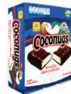
De la Rosa Chocolate Coconugs 12pcs CODE: CAN40