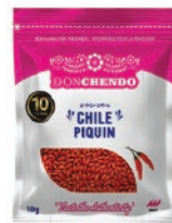
Don Chendo Chile Piquin 15/10g CASE CODE: CHL011-4