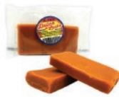
Peke Caramel Candy 16pcs CODE: CAN207