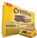
Nutresa Cremino Bicolor 24ct CODE: CAN143