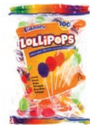
Canel's Fiesta Lollipop 100ct CODE: CAN200