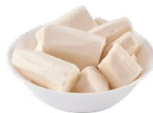
Exotic Yuca/Cassava 6/1.5kg CODE: SOM017