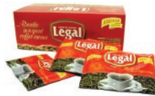
Cafe Legal Pouch 30/1oz CODE: BEV008