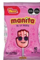
Vero manitas de la suerte 40pcs CODE: CAN131