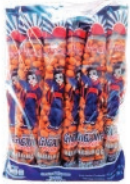
Arachi Japonés 10/180g CODE: SNK002