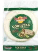
Don Pancho Flour tortilla 10" 12/8ct CODE: TOR058