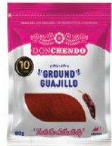
Don Chendo Ground Guajillo 10/80g CASE CODE: SEA052-3