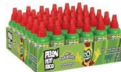
Pelon Pelo Rico 36/28g CODE: CAN73