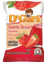
D'Gari gelatina Strawberry 24/170g CODE: GRO021