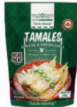
Don Chendo Tamal Cheese & Green Chili CODE: DON158-2