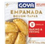
Goya Tapa para empanada 16/12oz FROZEN** 1 Criolla - SOM026 2 Hojaldradas - SOM027