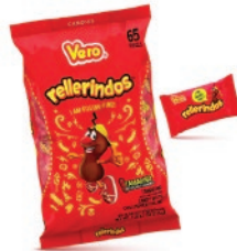
Vero Rellerindo 65pcs CODE: CAN121