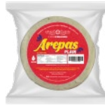
Don Chendo Plain Arepa 6pcs CODE: DON136