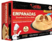
Panna Empanada Venezolana Ground Beef 4pcs CODE: ARK010