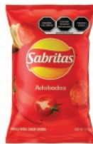
Sabritas Adobadas 105g CODE: SNK058