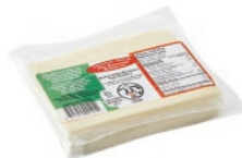
Asadero Cheese kg CODE: CHE022