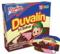
Ricolino Duvalin 18pcs