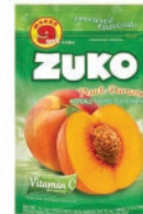
Zuko Peach 12/400g CODE: BEV133