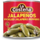
La Costeña Jalapeno Whole 1 12/12oz - JAL014 2 12/26oz - JAL015 3 24/7oz - JAL016