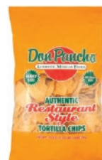
Don Pancho Restaurant Style 7/21oz CODE: CHI004