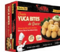
Panna Yuca Bites 12/10pcs CODE: SEA039