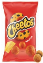
Cheeto Bola 110g CODE: SNK015