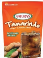
Naturas Tamarindo 12/12oz CASE CODE: BEV092