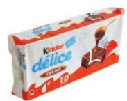
Kinder Chocolate Delice 10ct CODE: CAN246