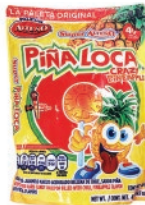
Alteno Pina Loca 40pcs CODE: CAN08