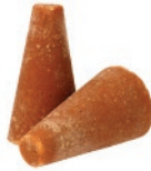
Piloncillo pc CODE: SEA077