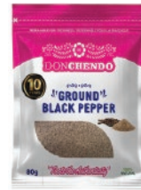
Don Chendo Ground Black Pepper 10/80g CASE CODE: SEA047-2