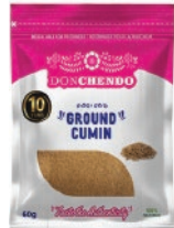
Don Chendo Ground Cumin 10/60g CASE CODE: SEA051-2