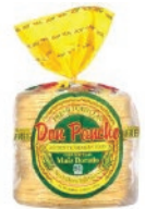
Don Pancho Corn Tortilla Yellow 1 16/30ct - TOR053 2 8/72ct - TOR057 3 Thin 12/54 - TOR015