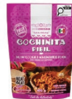
Don Chendo Cochinita 450g CODE: DON002

Slow-roasted pork marinated in achiote and citrus, a Yucatán classic bursting with rich, smoky flavor.