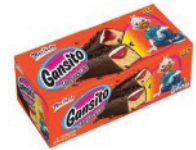
Gansito Cake 24pcs CODE: BKR019