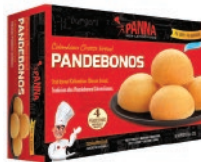
PandeBono Colombian 8/6pcs CODE: SOM052