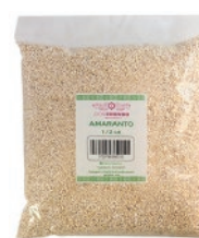
Amaranth 1/2 lb CODE: GRO102