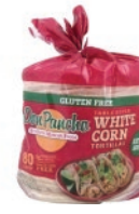
Don Pancho Corn Tortilla White 1 16/30ct - TOR052 2 8/72ct - TOR056