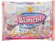
De la Rosa Mini Marshmallows 30pck CODE: CAN45