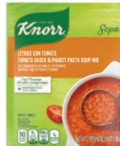
Knorr Soup Pasta Alphabet 12/3.5oz CODE: PAS001