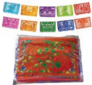
Papel Picado 10pcs CODE: HSW033-2