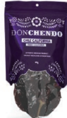
Don Chendo Chile California 10/ 60g CASE CODE: CHL005-6