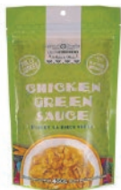
Don Chendo Chicken Green Sauce 450g CODE: DON117