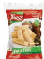
Tio Jorge Yuca Fries 20/1lb CODE: SOM047