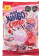
De La Rosa Paleta Cereza 24pcs CODE: CAN46