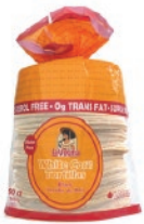
La Vikina Corn Tortilla 6/90ct CODE: TOR025