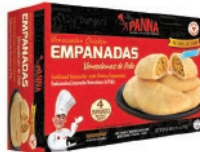
Panna Empanada Venezolana Chicken 4pcs CODE: ARK012