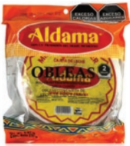
Aldama Oblea Mediana 5pcs CODE: CAN04