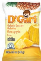
D'Gari gelatina Pineapple 24/170g CODE: GRO028