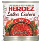
Herdez Salsa Casera