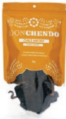
Don Chendo Chile Ancho 15/ 60g CASE CODE: CHL003-6