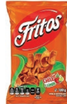
Fritos Chile y Limón 180g CODE: SNK030