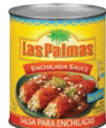
Las Palmas Red Sauce