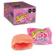
Bubbaloo bubblegum 47pcs