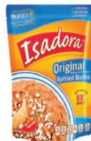
Isadora Original Refried Beans 8/15.2z CODE: BEN004