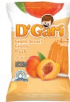
D'gari Gelatin Peach 24/4.2oz CODE: BEV195