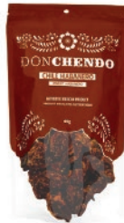
Don Chendo Chile Habanero 10/ 60g CASE CODE: CHL007-2