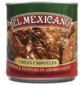
El Mexicano Chipotle Peppers 12/13.4oz CODE: CHP004