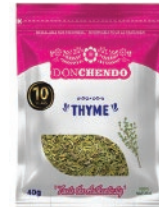
Don Chendo Thyme 10/40g CASE CODE: SEA099