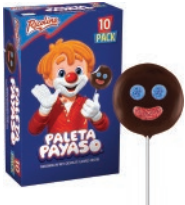
Ricolino Paleta Payaso 10pcs CODE: CAN103