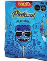
Vero Pintazul 48pcs CODE: CAN148