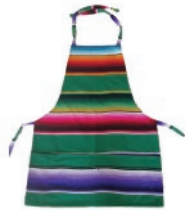
Mandil CODE: MSC010