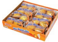
Bimbo Mini Mantecadas 8pcs CODE: BKR023