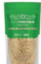
Don Chendo Rice 10/800g CASE CODE: GRO066-4