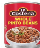
La Costeña Whole Pinto 12/20oz CODE: BEN009