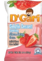
D'Gari gelatina MLK Strawberry 24/170g CODE: GRO026