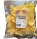
Mi Pueblo Potato Chips 80g CODE: SNK352