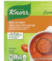
Knorr Soup Pasta Fideo 12/3.5oz CODE: PAS002