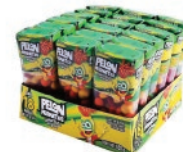
Pelon Pelonetes 18ct CODE: CAN87