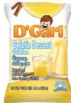
D'Gari gelatina Egnog 24/170g CODE: GRO020