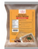
Don Chendo Refried Pinto Beans 500g *FROZEN* CODE: DON124