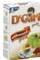
D'Gari gelatina Unflavored 24/28g CODE: GRO029