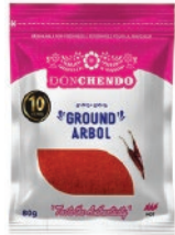
Don Chendo Ground Arbol 10/80g CASE CODE: SEA046-2