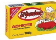
El Yucateco Achiote

La Costena Mole Rojo 12/8.5oz CODE: MOL009