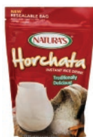
Naturas horchata 1 12/14oz CASE - BEV088 2 25Lbs - BEV089