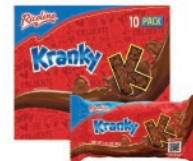
Kranky 10/40g CODE: CAN51