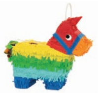
Pinata CODE: MSC012