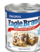
Condensed Milk Eagle Brand 24/300ml CODE: GRO088