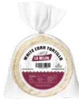
La Milpa Corn Tortilla 1 White 40/15ct - TOR083 2 White 12/40ct - TOR079 3 Yellow 40/15ct - TOR084 4 Yellow 12/40ct - TOR078