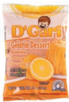
D'Gari gelatina Orange 24/170g CODE: GRO027