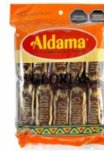
Aldama Glorias 10pcs CODE: CAN258