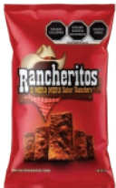
Rancheritos 160g CODE: SNK056