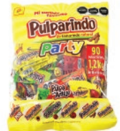
Pulparindo Party Mix 1.2kg CODE: CAN149