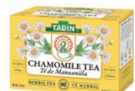
Tadin Te de Manzanilla 6/24ct CODE: GRO075