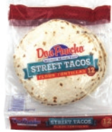
Don Pancho Street Taco Flour 12/12ct CODE: TOR013