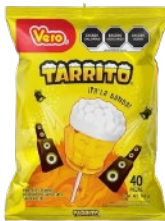
Vero Tarrito 40 pcs CODE: CAN125