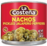
La Costeña Jalapeno Nacho 12/12oz CODE: JAL010