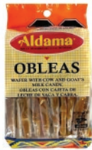
Aldama Oblea Mini 20ct CODE: CAN05