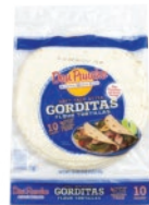
Don Pancho Flour Tortilla 8" 15/8ct CODE: TOR055