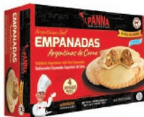
Panna Empanada Argentina Beef 8/4pcs CODE: ARK024