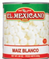
El Mexicano Hominy