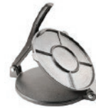
Tortilla Press CODE: HSW043