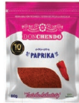
Don Chendo Paprika 10/80g CASE CODE: SEA055-2