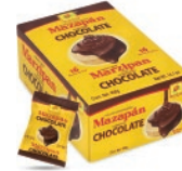
De la Rosa Mazapan Chocolate 16pcs CODE: CAN44