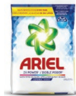
Jabon Ariel Original 1 9/1kg - HSW110 2 5/4kg - HSW171