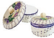
Tortilla Warmer CODE: HSW045