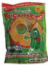
Alteno Pica Pepino 40pcs CODE: CAN156