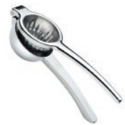
Lime Squeezer Reg CODE: HSW011