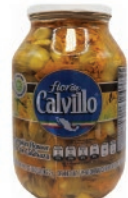
Flor De Calvillo Flor De Calabaza 12/32oz CODE: GRO188