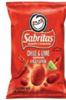
Sabritas Peanuts Chile y Limón 12/198g CODE: SNK059