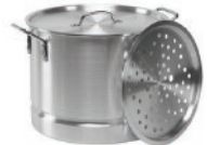
Tamalera 1 20 Qt - HSW037 2 24 Qt - HSW038 3 32 Qt - HSW039 4 40 Qt - HSW040 5 52 Qt - HSW041