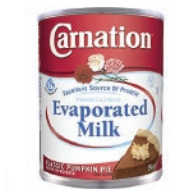
Carnation Evaporated Milk 24/354ml CODE: GRO112