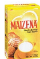
Maizena Natural 24/400g CODE: BEV079