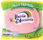
Arcoiris Oblea Mediana 125g CODE: CAN10