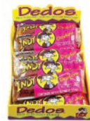
Indy Dedos Tamarindo 12pcs CODE: CAN50