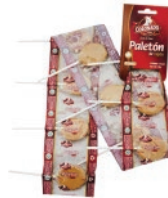
Coronado Paletón tira 10ct CODE: CAN37