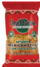
Don Pancho Mexican Style 7/20oz CODE: CHI003