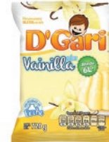
D'Gari gelatina Vainilla 24/170g CODE: GRO031