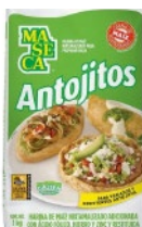
Maseca Antojitos 10/2 lb CODE: FLR025