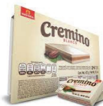
Nutresa Cremino Blanco 24ct CODE: CAN86