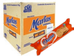
Galletas Marias Rollos 24/4.9oz CODE: BKR014