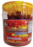
Banderilla Jabalina Xtreme 50pcs CODE: CAN135