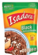
Isadora Refried Black Beans 8/15z CODE: BEN006