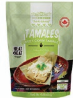
Don Chendo Tamal Sweet Corn CODE: GRO071-2