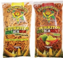
Super Leon Churritos 20/16oz CASE