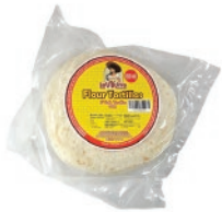
La Vikina Flour Tortilla 6" 24/12ct CODE: TOR030