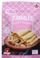
Don Chendo Tamal Sweet Strawberry CODE: DON071