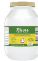
Knorr Sazonador Pollo 3.7 k CODE: SEA086