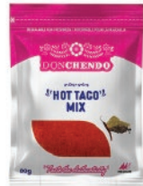
Don Chendo Hot Taco Mix 10/80g CASE CODE: DON042