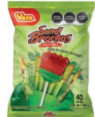
Vero SandiBrocha 40pcs CODE: CAN132