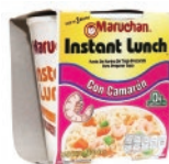
Maruchan Soup 12/2.25oz