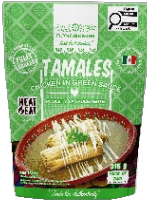
Don Chendo Tamal Chicken Green Sauce CODE: DON068-2