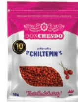
Don Chendo Chile Chiltepin 15/10g CASE CODE: CHL013-4