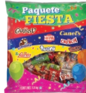
Canel's Paquete Fiesta 3.3lb CODE: CAN31