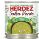
Herdez Salsa Verde