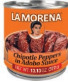
La Morena Chipotle Peppers 1 12/13oz - CHP008 2 24/7oz - CHP010 3 12/28oz - CHP009