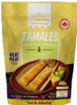
Don Chendo Tamal Sweet Pineapple CODE: DON154