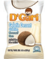
D'Gari gelatina Coconut 24/170g CODE: GRO018