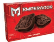
Gamesa Emperador Chocolate 6pack CODE: BKR015