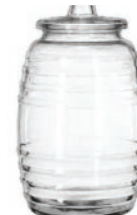
Vitrolero 1 Plastico 20L - HSW075 2 Small- HSW076