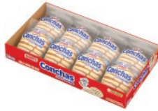
Bimbo Conchas 8pcs CODE: BKR009