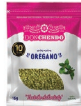
Don Chendo Oregano 10/15g CASE CODE: SEA070-3