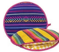
Tortilla Pocket CODE: HSW072