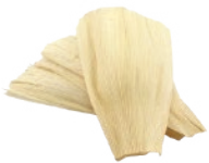
Hoja para Tamal 16oz CODE: MSC009