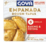
Goya Tapa para empanada 16/12oz FROZEN* 1 Criolla - SOM026 2 Hojaldradas - SOM027