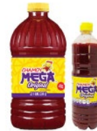
Mega Chamoy 1 12/1lt - HOT053 2 6/1galon - HOT054