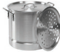
Tamalera 1 20 Qt - HSW037 2 24 Qt - HSW038 3 32 Qt - HSW039 4 40 Qt - HSW040 5 52 Qt - HSW041