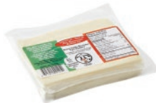
Asadero Cheese kg CODE: CHE022