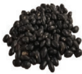
Black Beans 10 kg CODE: DBN001-7