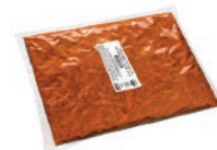
Pastor kg CODE: DON088-2