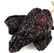
Chile Pasilla 2lb CODE: CHL010