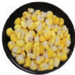
Yellow Corn 2.5lb FROZEN* CODE: GRO147