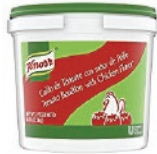
Knorr Sazonador Tomate 2kg CODE: SEA091