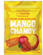
Don Chendo Fruit with Chamoy 1 Mango 10/100g - DON054-1 2 Tamarind 10/100g - SNK070-1 3 Pineapple 10/100g - DON161-1