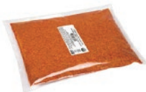
Don Chendo Chorizo Loose kg CODE: DON096