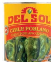
Del Sol Poblano Pepper 6/100oz CASE CODE: PEP003