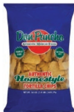
Don Pancho HomeStyle Chip 7/21oz CODE: CHI002