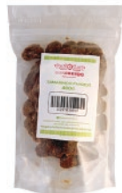
Don Chendo Tamarindo Chamoy 400g CODE: SNK070