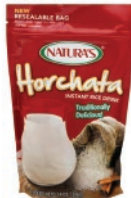
Naturas horchata 1 12/14oz CASE - BEV088 2 25lbs - BEV089