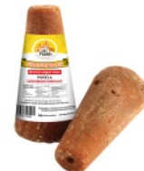
Piloncillo pc CODE: SEA077