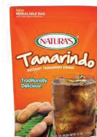
Naturas Tamarindo 12/12oz CASE CODE: BEV092