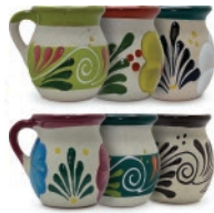
Taza Barro Mugs 24pcs CODE: HSW042