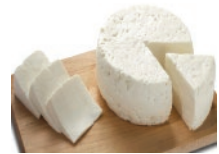
Fresco Cheese kg CODE: CHE016