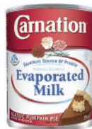
Evaporated Milk 24/354ml CODE: GRO112