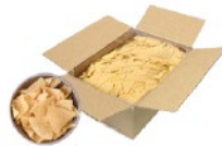
Don Pancho Yellow Thin Bulk 30Lb CODE: TOR064