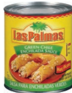
Las Palmas Green sauce 12/28 oz CODE: SAL032