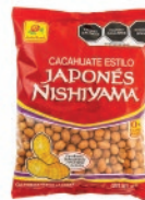
De la Rosa Japonés 900g CODE: CAN240