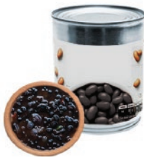
Whole Black Beans Can 6/100 CODE: BEN012