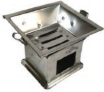
Bracero Mexican Med CODE: HSW089