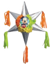
Pinata 1 Star - MSC013 2 Medium - MSC012