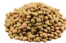
Green Lentil 25kg CODE: GRO044-3