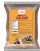
Don Chendo Refried Pinto Beans 5lbs CODE: DON142