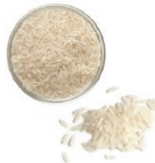
White Rice Long Grain 50 lbs CODE: GRO083