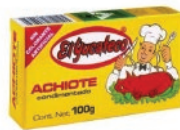
El Yucateco Achiote 1 12/425g - SEA003 2 12/100g - SEA002 3 10lbs - SEA001