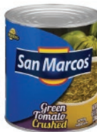
San Marcos Crushed tomatillo 6/100oz CASE CODE: TOM008