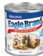
Condensed Milk Eagle Brand 24/300ml CODE: GRO088