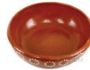
Plato Pozolero CODE: HSW093