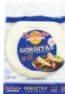
Don Pancho Flour Tortilla 8" 15/8ct CODE: TOR055