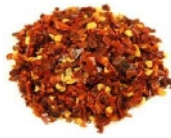
Red Pepper Crushed chili 2lb CODE: SEA017