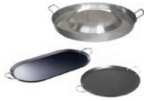
Comal 1 Redondo Med - HSW005 2 Sombrero Med - HSW079 3 Sombrero Small - HSW078 4 Oval - HSW086