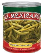
El Mexicano Nopalitos 6/100oz CASE CODE: GRO160