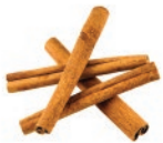
Canela Stick 1lb CODE: SEA015