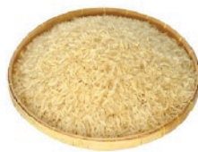
Parboiled Rice 50 lbs CODE: GRO066-3