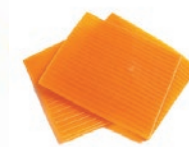
Gustino 11x11 33 lb CODE: SNK076