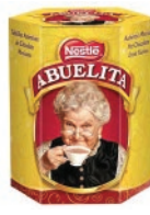
Chocolate Abuelita 12/19oz CODE: BEV013