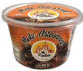
Mi pueblo Mole Black 10/500g CODE: MOL016-2