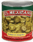
El Mexicano Nacho Jalapeno 6/100oz CASE CODE: JAL037