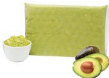
Avocado Pulp 6/2lb FROZEN* CODE: GRO143