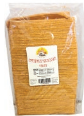
Mi Pueblo Cuadro 11X11 20/10 pc CODE: SNK211