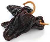
Chile Ancho 2lb CODE: CHL003-5