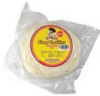
La Vikina Flour Tortilla 6" 24/12ct CODE: TOR030