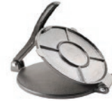
Tortilla Press CODE: HSW043