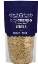
Don Chendo Green Lentil 10/800g CASE CODE: GRO044-4