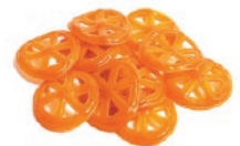
Gustino Rueda 33 lb CODE: SNK077