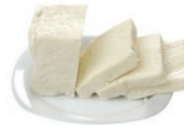
Cotija Cheese kg CODE: CHE017