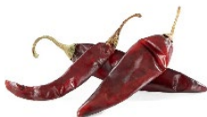
Chile Pulla 2lb CODE: CHL012-1