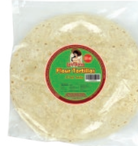
La Vikina Flour Tortilla 12" 12/10ct CODE: TOR027