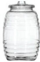
Vitrolero 20L CODE: HSW075