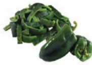
Rajas Poblanas 4/5LB FROZEN* CODE: GRO089