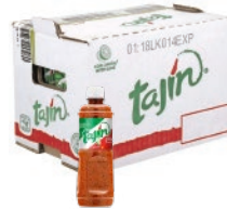
Tajin 1 12/14oz - SEA095 2 24/5oz - SEA096 3 6/32oz - SEA131