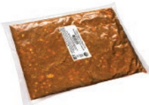
Barbacoa kg CODE: DON002-2