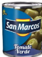
San Marcos Whole tomatillo 6/100oz CASE CODE: TOM011