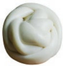
Oaxaca Cheese 200g CODE: CHE014