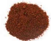
Hot Taco Mix 2lb CODE: DON042-1