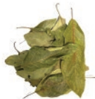
Avocado Leaf 1lb CODE: SEA058