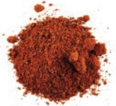
Mexican Chili Powder 2lb CODE: SEA069