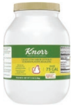
Knorr Sazonador Pollo 3.7 k CODE: SEA086