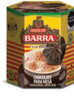
Chocolate Ibarra 12/19oz CASE CODE: BEV016