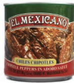
El Mexicano Chipotle Peppers 1 12/13.4oz - CHP004 2 6/108oz - CHP005