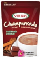
Naturas Champurrado 12/12oz CASE CODE: BEV087