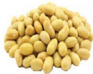
Peruano Beans 50 lb CODE: DBN008-3