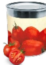
Whole Tomatoes 6/100oz CODE: GRO084