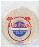
Don Pancho Flour Tortilla 13" 10/10ct CODE: TOR009