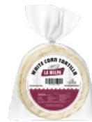
La Milpa White Corn Tortilla ① 12/40ct - TOR079 ② 40/15ct - TOR083