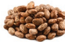
Pinto beans 10 kg CODE: DBN010-1