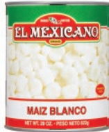
El Mexicano Hominy 6/100oz CODE: GRO034