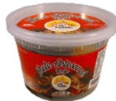
Mi pueblo Mole Red 10/500g CODE: MOL018