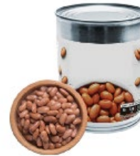
Whole Pinto Beans Can 6/100 CODE: BEN013