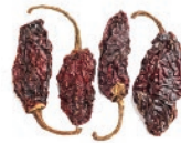
Chile Morita 2lb CODE: CHL008