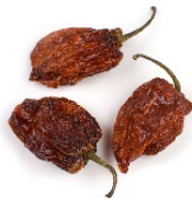
Chile Habanero 2lb CODE: CHL007-4