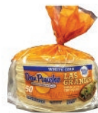
Don Pancho Corn Tortilla 7" 6/46ct CODE: TOR054