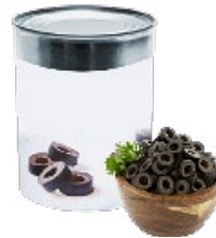
Olives Sliced Blk 6/100oz GRO062