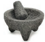
Molcajete 1 Large - HSW090 2 Medium - HSW030 3 XL - HSW077