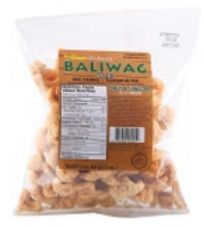
Mang Ramon Chicharron 24/85g CASE CODE: SNK053