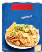
Nacho Cheese Sce 6/100oz CODE: GRO098