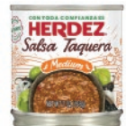
Herdez Salsa Taquera 12/7oz CODE: SAL019