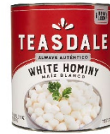
Teasdale Hominy 6/100oz CODE: GRO080