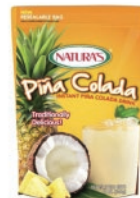
Naturas Pina Colada 12/12oz CASE CODE: BEV091