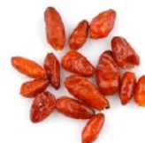
Chile Piquin 1/2 Lb CODE: CHL011