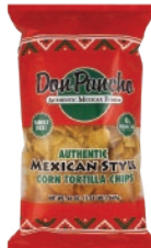
Don Pancho Mexican Style 7/20oz CODE: CHI003