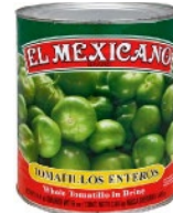
El Mexicano Whole Tomatillo 12/27oz CASE CODE: TOM004