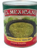
El Mexicano Crushed Tomatillo 6/100oz CASE CODE: TOM003