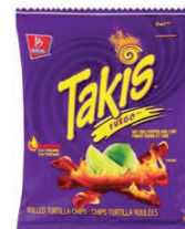
Takis Fuego 18/90g CODE: SNK064