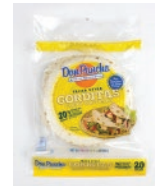
Don Pancho Flour Tortilla 6" 12/16ct CODE: TOR059