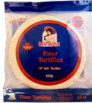
La Vikina Flour Tortilla 10" 10/10ct CODE: TOR026