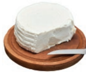
Panela Cheese kg CODE: CHE015