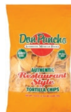
Don Pancho Restaurant Style 7/21oz CODE: CHI004