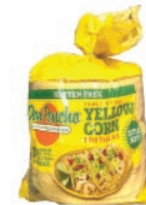
Don Pancho Corn Tortilla Yellow 8/72ct CODE: TOR057