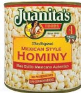
Juanita Hominy 6/100oz CASE CODE: GRO058