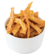
Tortilla Soup Strips 300g CODE: TOR033