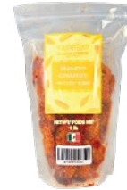
Don Chendo Mango Chamoy 1 lb CODE: DON054