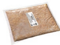
Carnitas kg CODE: DON087-2