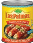
Las Palmas Red Sauce 12/28oz CODE: SAL033