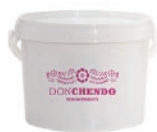
Don Chendo Lard-Manteca Bucket 3.5kg CODE: DON045