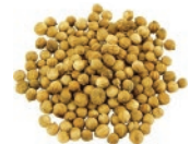
Coriander Seeds 1lb CODE: SEA023