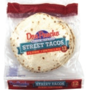
Don Pancho Street Taco Flour 12/12ct CODE: TOR013