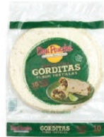
Don Pancho Flour tortilla 10" 12/8ct CODE: TOR058