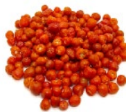
Chiltepin 1/2 Lb CODE: CHL013